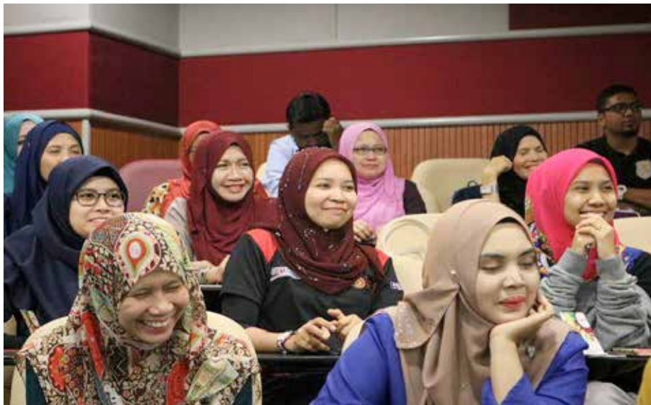
All participants enjoyed the session